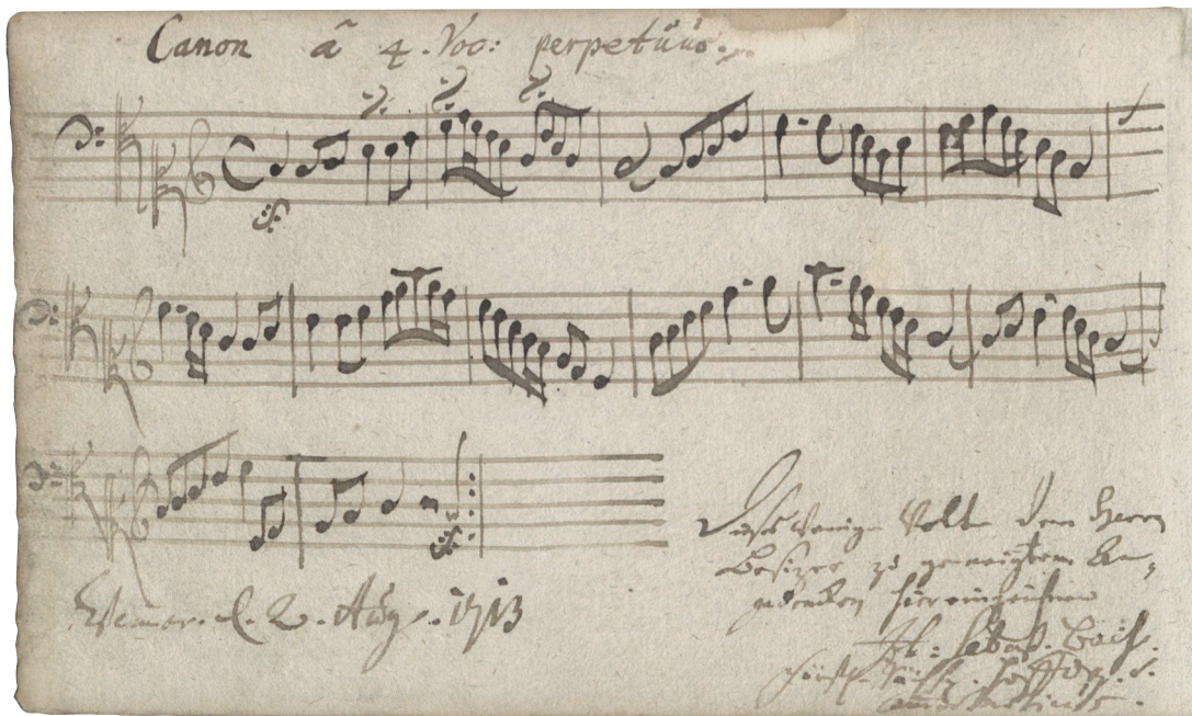
Figure 5.1. J. S. Bach, album entry with canon BWV 1073 (single leaf), Houghton Library, bMSEng 870 (35b). Reproduced at actual size.

The single leaf on which the canon is notated measures 8.5 x 14 cm and was obviously removed at some point from an unknown friendship book whose original owner was not named by Bach. Therefore, the true, if unintended, riddle of the piece composed as a genuine riddle canon consists in the identification of its dedicatee, the mysterious “Herr Owner” of the album. Curiously, the enigmatic notation of the riddle canon never presented a problem, as clefs and entry marks for the canonic voices were provided by Bach. Hence, the correct contrapuntal solution was published in 1886 by Paul von Walderssee 2 on the basis of the first publication of the unresolved canon in volume I of Philipp Spitta’s Bach biography of 1873, 3 ten years after the single-leaf manuscript had shown up on the antiquarian market in 1863.