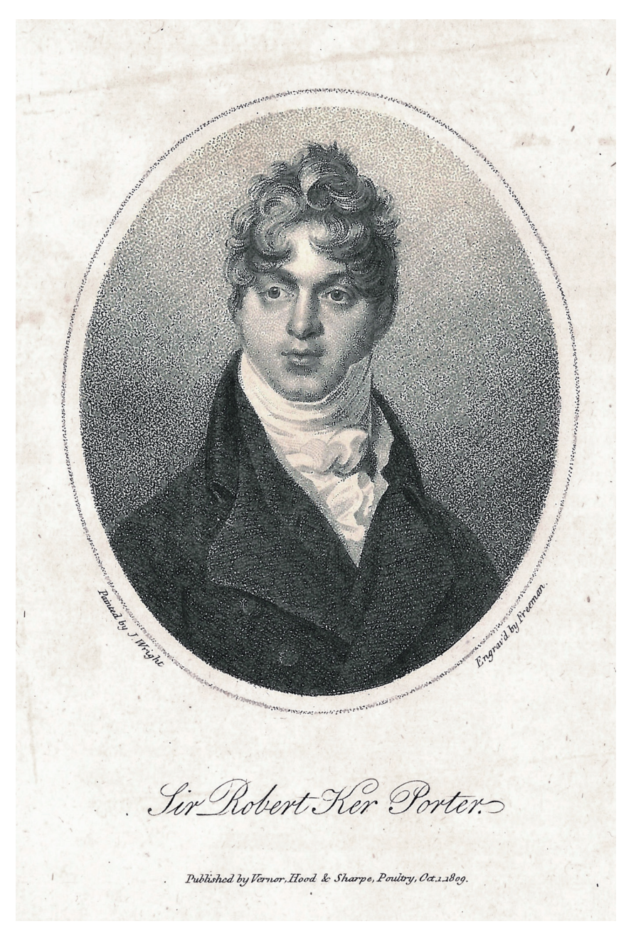
Figure 3. Sir Robert Ker Porter. Painted by J. Wright. Engrav'd by Freeman. London: Vernor, Hood & Sharpe, Poultry, 1809. 84 x 68 mm (oval). Private collection.