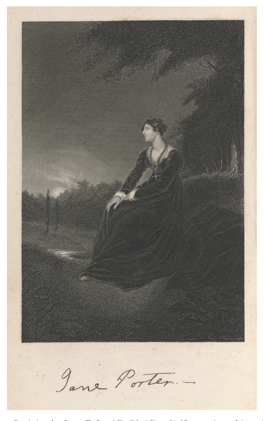
Figure 1. Frontispiece. Jane Porter. The Pastor's Fire-Side: A Biographical Romance. A new edition, revised. London: George Virtue, 1846. Bequest of Evert Jansen Wendell, 1918. *EC8. P8343.817pc 23 cm.