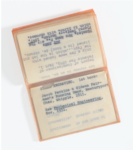
Figure 5. Pages from JB’s vade mecum marking historic moments in the history of American graphic processes. b*2009M-46

Next to the bottom, beside some tape recordings that remain to be investigated, was Jake’s vade mecum , a booklet of plastic envelopes, about 4¾” x 2⅞”, with a flap at one end to tuck into a wallet. 2 Some of the notes are specific wants for BAL : “LMA: OFG: No advts on copyright,” “WANT: Seven Gables date 1852,” “H B Stowe / Lay /