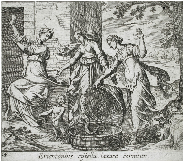
Erichthonius cistella laxata cernitur.

Erichthonios Released from His Basket ( Erichthonius cistella laxata cernitur ). Engraving by Antonio Tempesta; Plate 14 of a series of illustrations for Ovid's Metamorphoses , published by Wilhelm Janson (Amsterdam, ca. 1606). Los Angeles County Museum of Art , Los Angeles County Fund (65.37.98).