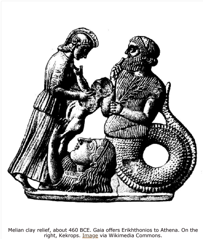
Melian clay relief, about 460 BCE. Gaia offers Erikhthonios to Athena. On the right, Kekrops.

The ancient image that I choose as the lead-off illustration shows another goddess, Gaia/Ge or Mother Earth herself, who is seen emerging from underground and presenting her very own baby boy to the goddess Athena, who receives the child. Athena will raise the baby in her role as mother of a son she “never” had. Looking on, in the same image, is a figure whose upper half is human while his lower half is serpentine. He is known as Kekrops to the people of Athens. In this version of the many surviving visual representations of such a scene, the baby boy is not marked by any overtly serpentine features. In other versions, however, as we will see, the baby too, like Kekrops, is pictured as half-human, half-serpent.