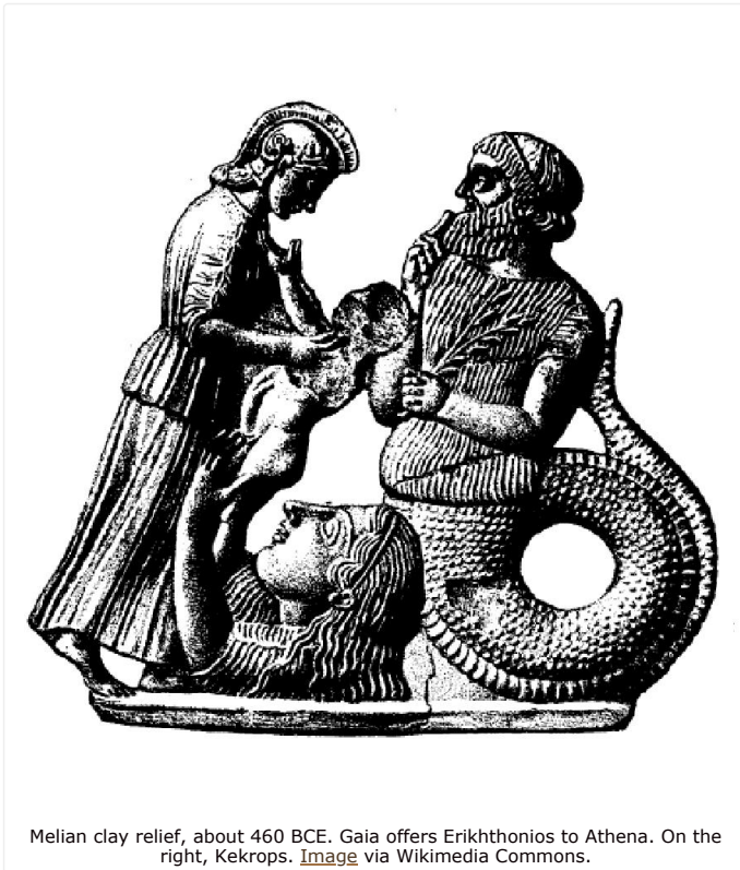
Melian clay relief, about 460 BCE. Gaia offers Erichthonios to Athena. On the right, Kekrops.

§9c. The mystical vision experienced by the daughters of Kekrops, as narrated at 1.18.2 by Pausanias, is relevant to the identity of Kekrops himself, their father, whose form is human from the waist up and serpentine from the waist down. To say it in Greek: Kekrops is diphuēs 'double-natured' (scholia for Aristophanes Wasps 438): he is half human, half snake. This biformity of Kekrops is shown clearly in some ancient visual representations. In the illustration I showed for the cover of this essay, for example, we see Kekrops in attendance at the moment when Gaia/Gē the Earth Mother hands over to Athena the infant Erichthonios: