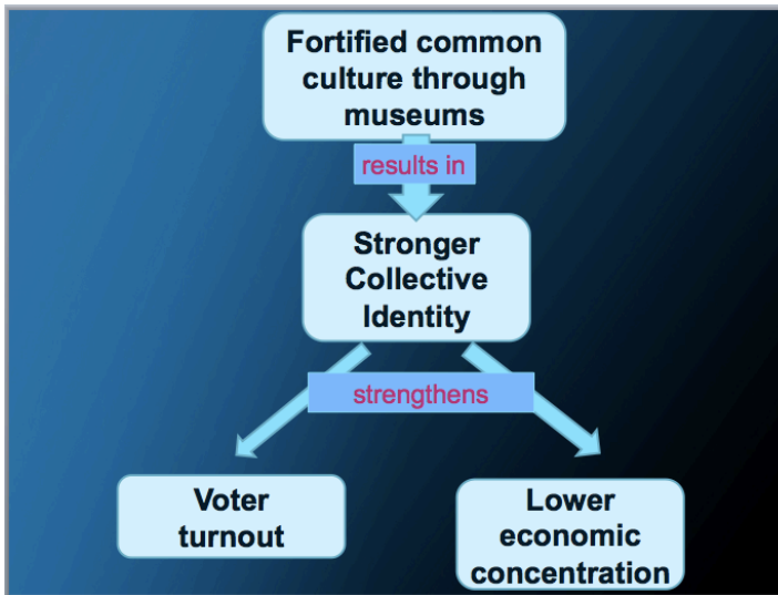
Flowchart representing hypothesized relationships in the prior Literature Review