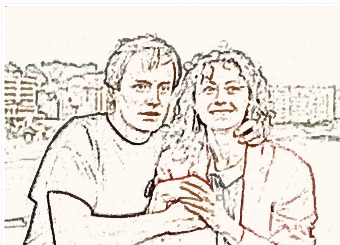
After Le Rayon Vert , directed by Éric Rohmer (1986): Jacques and Delphine before the green ray.

§0. It is summer. A young woman and a young man are sitting side by side at a beachfront, looking out toward the vast sea that is facing them. They aim their gaze westward, viewing what seems like an infinite stretch of water that reaches all the way to the darkening horizon where the sea finally meets an infinite sky. As they watch the sun sink slowly into the sea, the young woman starts weeping. Then, suddenly, at the very moment when the glowing orb finally goes under, it gives off a subtle green flash. This is the green ray, which is a literal translation of the French words le rayon vert . The moment I am describing takes place in a film directed by Éric Rohmer , which actually bears the title Le Rayon Vert . It originally appeared in 1986. But Le Rayon-Vert is also the title of a romantic novel by Jules Verne, which appeared over a century earlier, in 1882. The novel was in fact the original inspiration for the film, though the stories differ radically. In the film, the story ends on a seemingly happy note: once she sees the green ray, the young woman who was weeping a moment earlier is now smiling as she cries out: oui ! But the happiness of this moment marked by the outcry of 'yes!' is not what interests me the most in this film: rather, I will highlight the earlier moment of weeping.