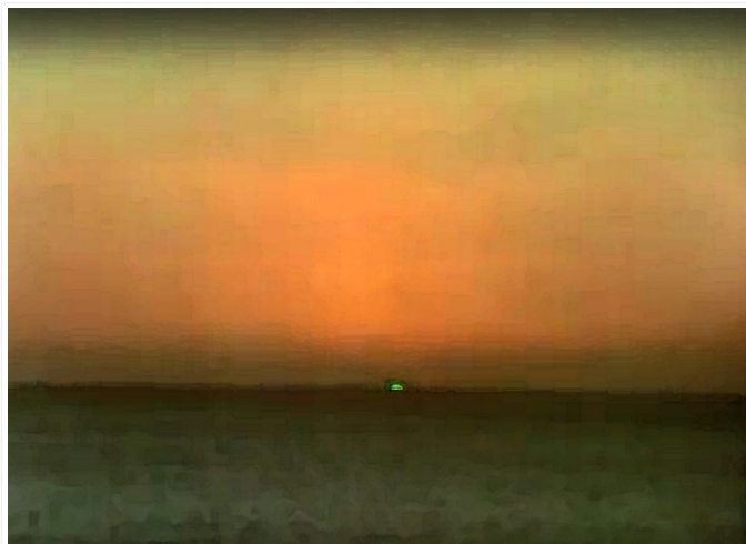
After Le Rayon Vert , directed by Éric Rohmer (1986): the green ray at sunset.