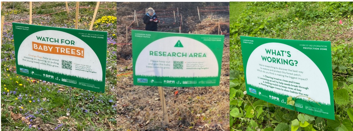
Figure 4. Research study signage provided by Casey Trees.

Area #1 was planted in 2021. Areas #2-5 were installed in 2022 for ANR research.