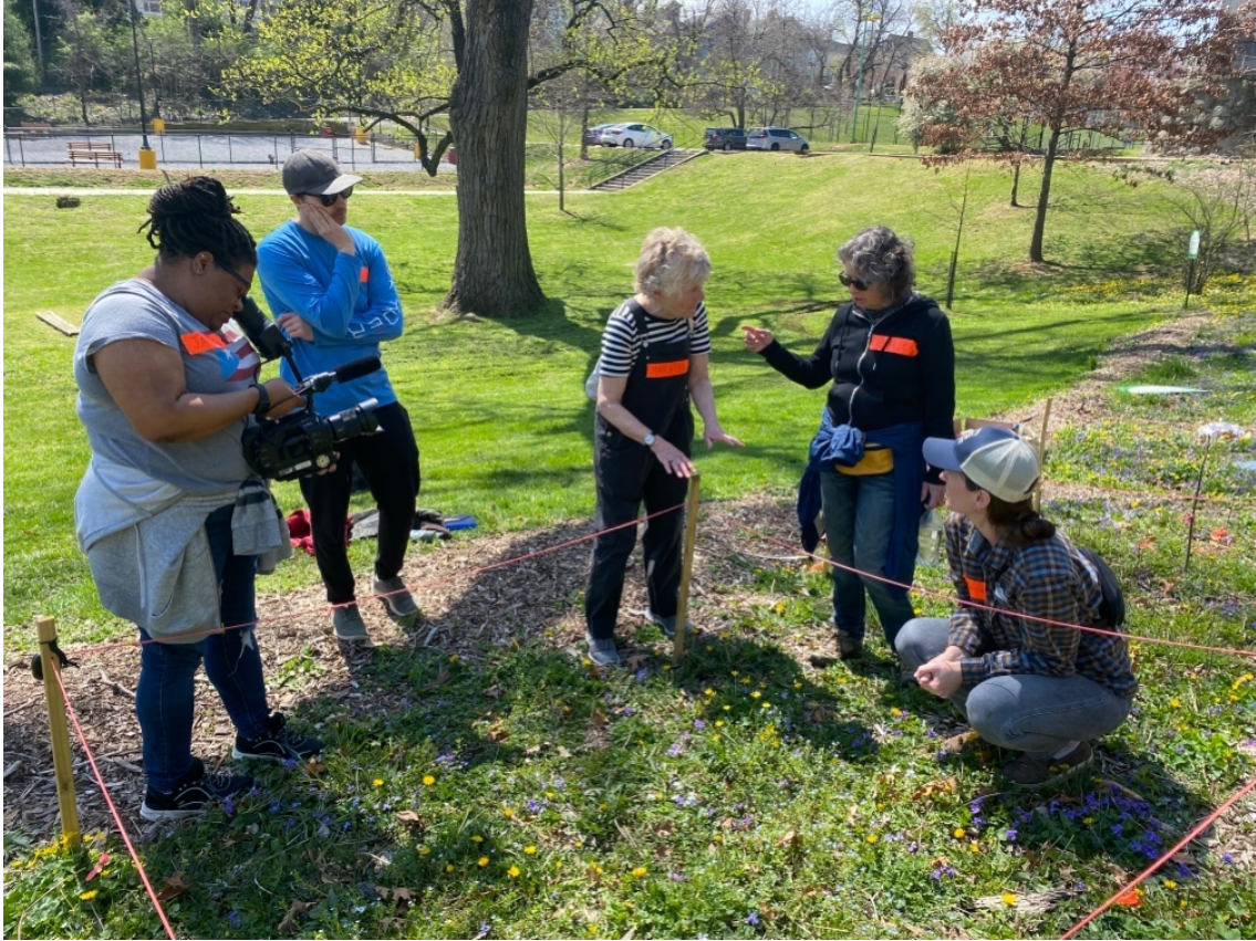
Figure 10. Graduate student records documentary footage while volunteers learn seedling identification.