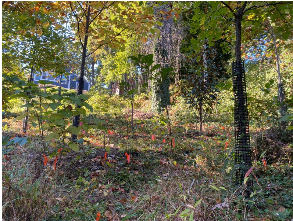
Figure 1. Volunteer seedlings among planted area at Langdon Park.

At Langdon Park in Washington, D.C., a 2.2-acre urban forest patch is the focus of a public-private management partnership. When a section of forest was illegally cleared, the city replanted the area with 25 young trees. Over the following growing season, hundreds of seedlings sprouted around the planted area (Figure 1). Community members wondered what caused the regeneration when so few trees were sprouting in other canopy gaps in the forest patch and wanted to know if they could replicate the phenomenon elsewhere and assist the forest in its own recovery.