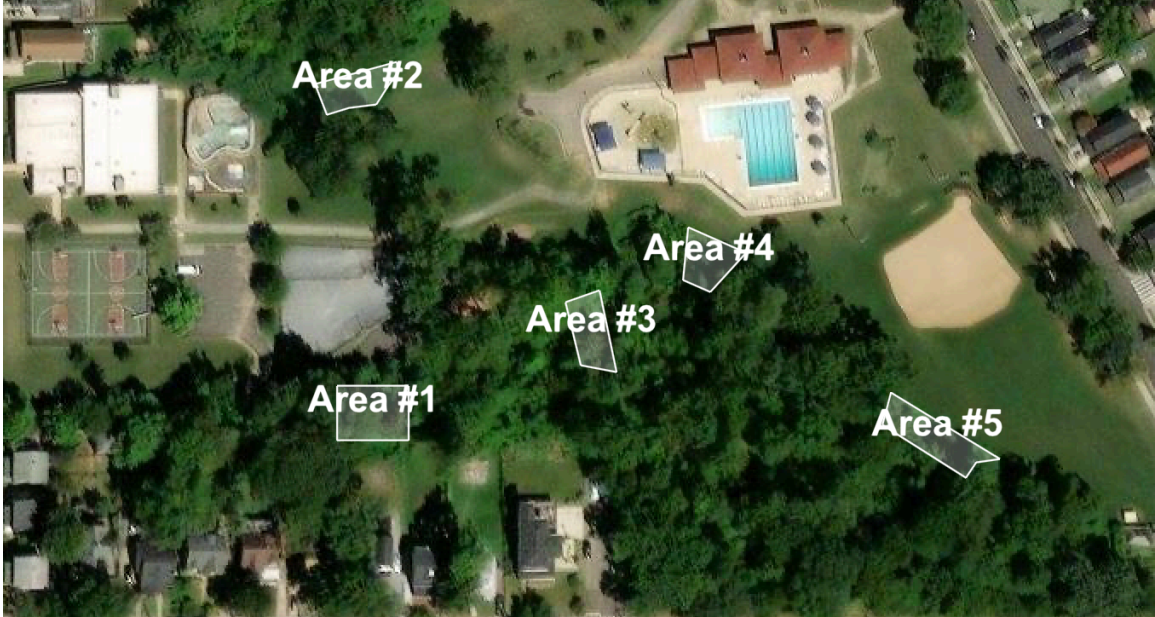
Figure 3. Research areas at Langdon Park.

Area #1 was planted in 2021. Areas #2-5 were installed in 2022 for ANR research.