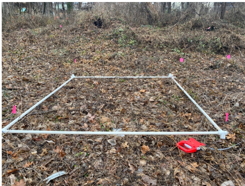
Figure 5. PVC piping for plot delineation.