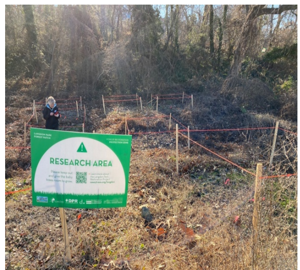
Figure 8. Site design improvements from year 1 to year 2