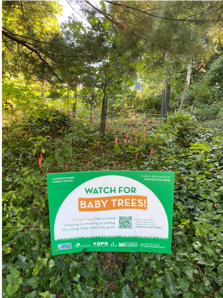
Langdon Park, Washington, D.C. 2023