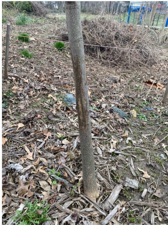
Figure 9. Deer rubbing on planted tree at Langdon Park.

Another meaningful variable that may be present, but was not measured, between Queen's Chapel Forest Patch and Langdon Park Forest Patch is deer presence. In Langdon Park, deer were documented on occasion during the research period and two planted trees showed signs of deer rubbing in the second year (Figure 9), but the deer presence seems to be relatively low, probably because of a perimeter of major roadways. In contrast, deer can access Queen's Chapel Forest Patch via a nearby rail line that could serve as a wildlife corridor. Neighbors report they only occasionally see deer there, but that does not rule out a regular presence.