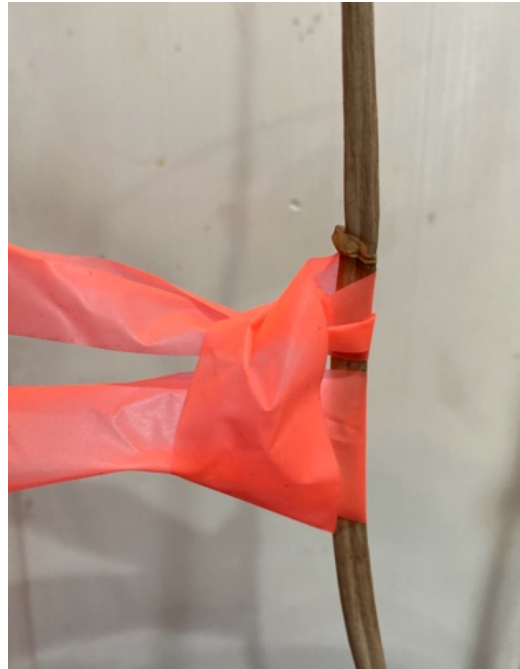
Figure 7. Seedling tagged with flagging tape.

plots were also restaked using 3-foot surveyor stakes and thicker nylon cord to provide better visibility and durability during the growing season (Figure 8).