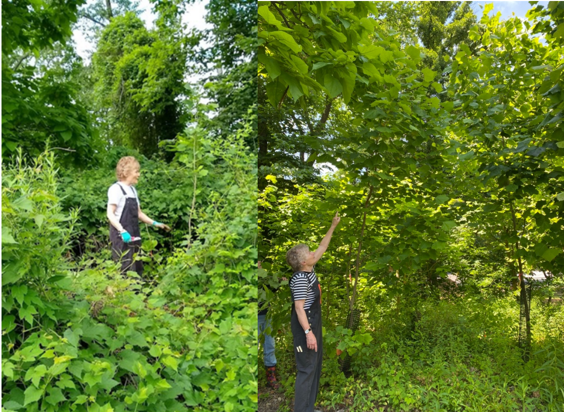
Figure 11. A tulip tree ( Liriodendron tulipifera ) liberated in 2020 provides canopy cover in 2023.