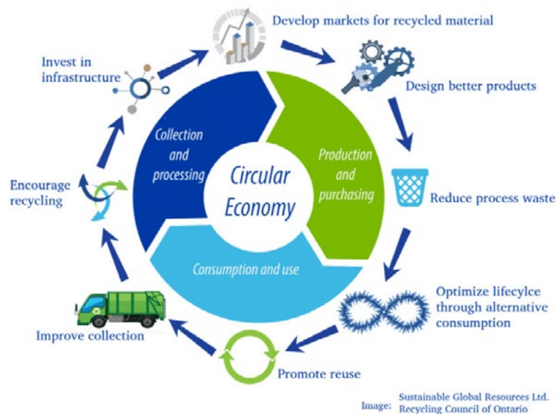
Figure 2. Circular Economy Value Chain Approach (Recycling Council of Ontario 2020)

Before the spread of COVID-19, policy and regulatory actions had begun to address the ramifications of a linear economy approach by mandating reductions in single-use plastic consumption, increasing recycling, and developing bio-alternatives to petroleum-based materials.