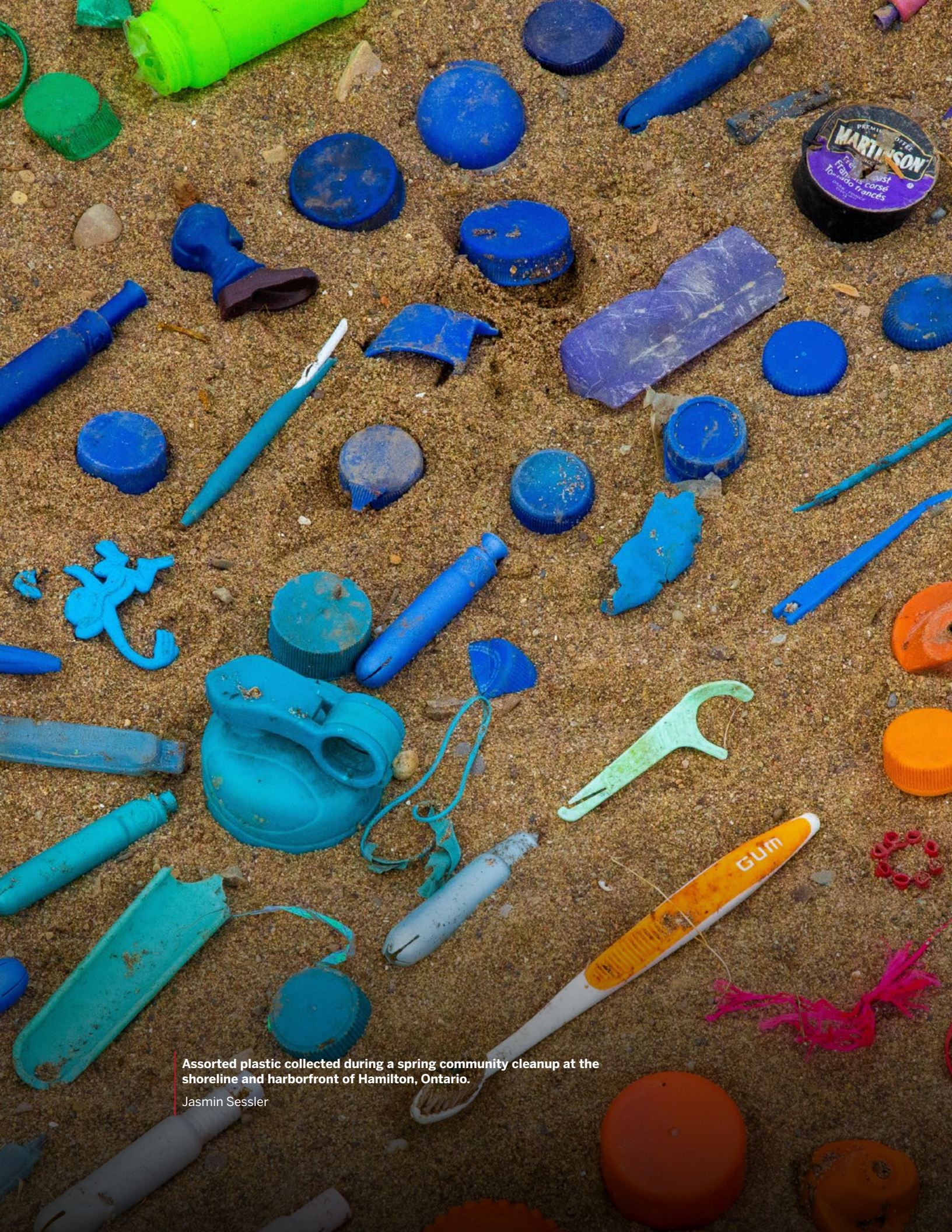
Assorted plastic collected during a spring community cleanup at the shoreline and harborfront of Hamilton, Ontario.