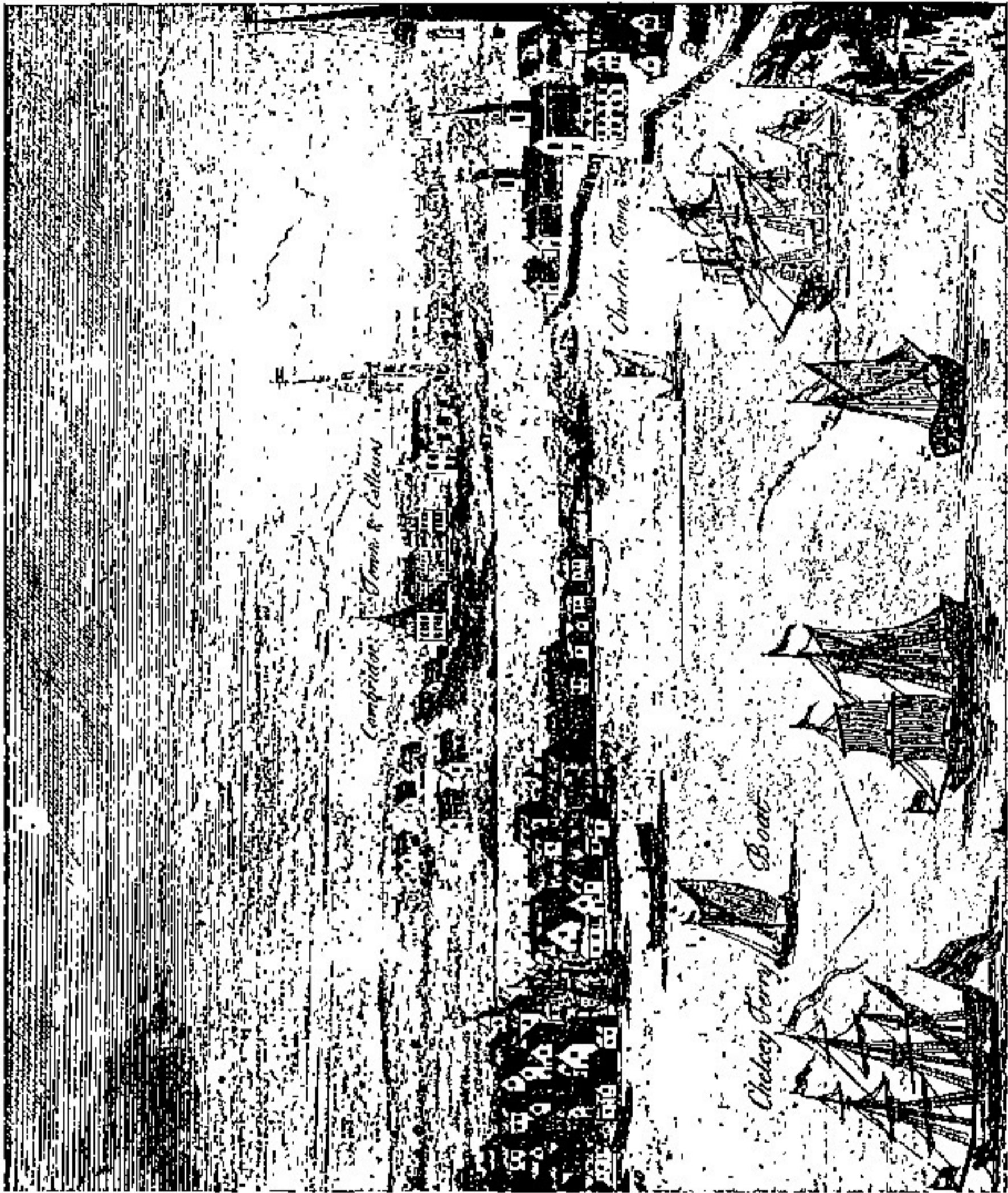
PLATE VIII ENLARGED SECTION OF BURGIS-PRICE VIEW OF BOSTON, 1743