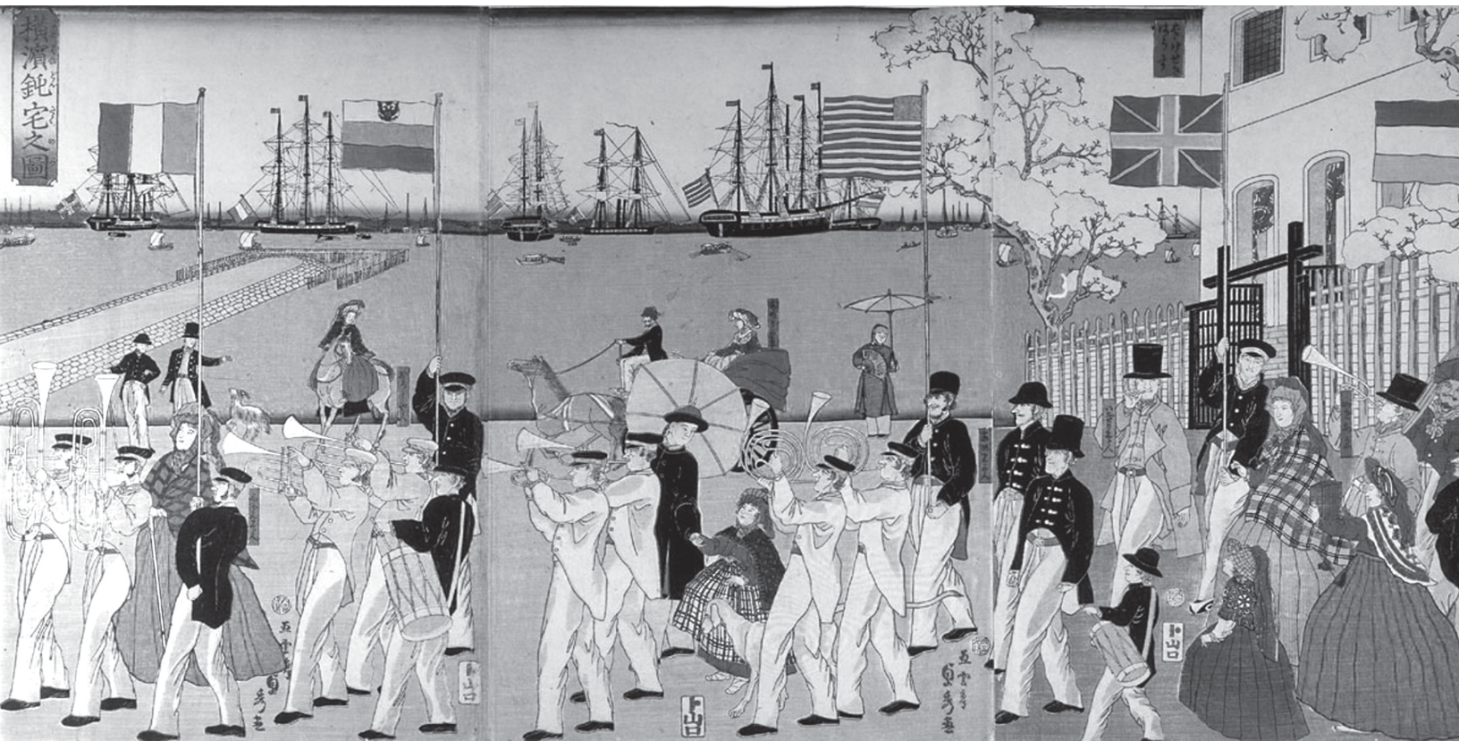
Sunday in Yokohama by Utagawa Sadahide (1807–ca. 1878). Westerners represented by the flags of the “Five Nations.” This image includes Chinese and Indian servants.

Quickly, the new Japanese government embarked on its own colonial expansion. In 1872, Japan annexed the Ryūkyū Kingdom in Okinawa. And through victories in wars with China (1894–95) and Russia (1904–05) Japan acquired Taiwan; political and commercial rights in various parts of China, Manchuria, and Korea; and the northern island of Sakhalin. The Japanese Navy, closely modeled on the British Navy, expanded rapidly and by the 1920s was one of the world’s five great naval powers that agreed to arms limitations through the Washington Naval Treaty (1922) and the London Naval Treaty (1930). In 1936, Japan renounced both treaties, setting off a naval arms race.