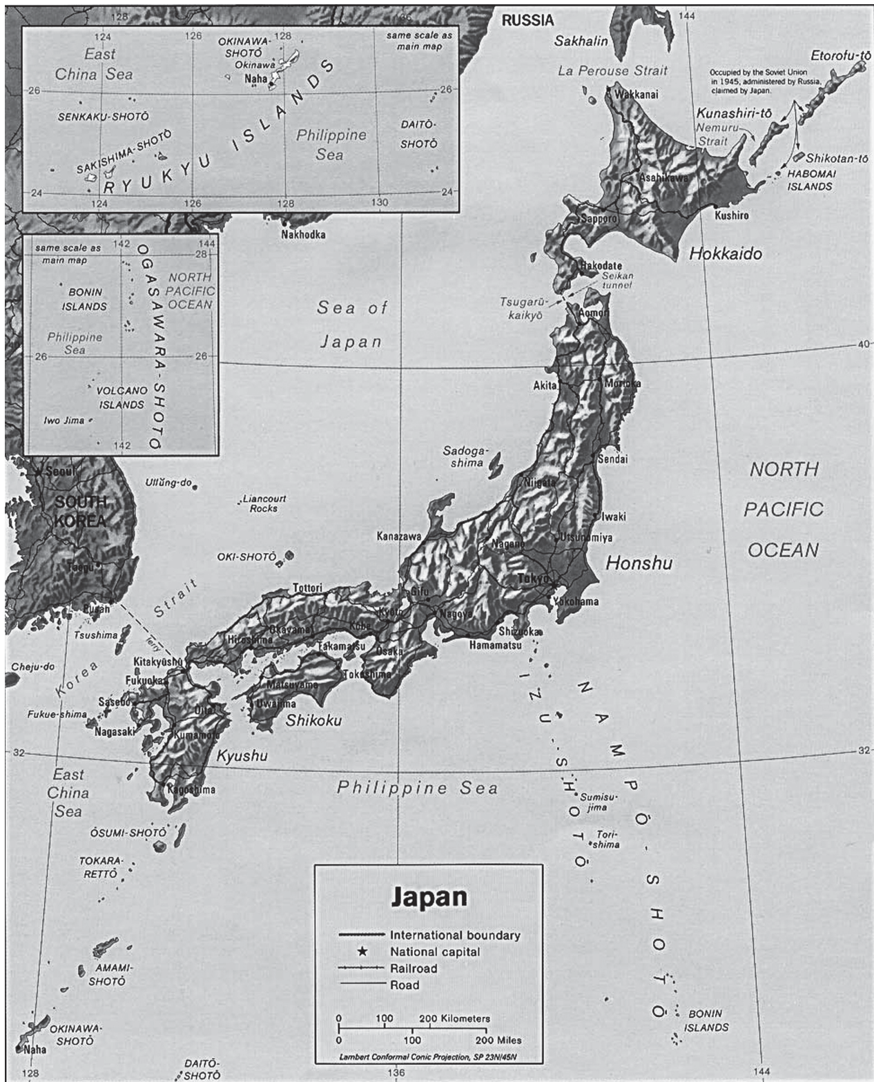
Map of Japan.

Japan's coastlines stretch more than 18,480 miles, and no point anywhere in Japan is more than ninety-three miles from the sea, so maritime resources are accessible almost everywhere in Japan.