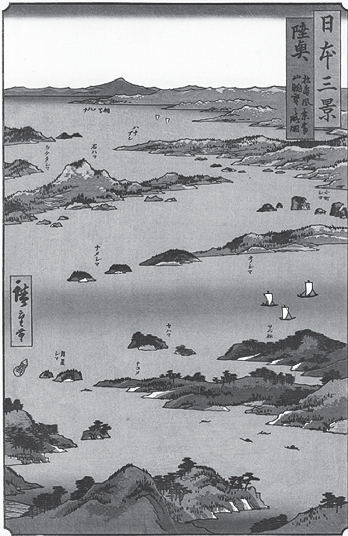
Hiroshige print of the islands of Matsushima in Mutsu Province. Source: Fuji Arts website at http://tinyurl.com/n9w66ge .

varieties of fish (approximately 10 percent of all known saltwater species), together with several hundred more species of shellfish, and almost all edible species have played some role in Japanese cuisine. Archaeological excavations of shell mounds reveal that during the Jōmon period (ca. 10,000–300 BCE) many varieties of fresh and saltwater fish and shellfish were the mainstay of the diet of the earliest human inhabitants of the Japanese islands; Jōmon people used quite sophisticated techniques for trapping large, open-ocean species, including dolphins and tuna.