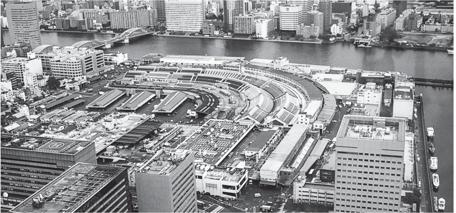
The Tsukiji Market as seen from Shiodome.