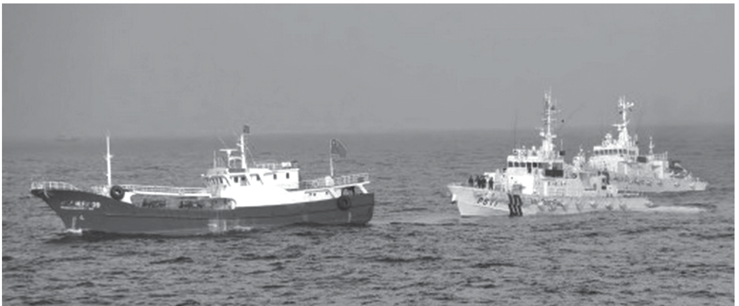
Saturday, February 2, 2013, file photo released by Japan Coast Guard 11th Regional Headquarters shows Japan Coast Guard patrol boats approach a Chinese fishing boat, left, off the northeastern coast of Miyako Island, about 200 kilometers (124 miles) southwest of the disputed islands, called Senkaku in Japan and Diaoyu in China.