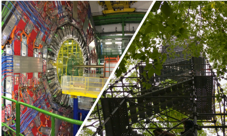
Figure 2: Research teams across the sciences are integrating data provenance methods into their research practices in response to increases in computational demands. On the left: The Compact Muon Solenoid (CMS) experiment at CERN during the technical stop in February 2017. On the right: One of several research towers used for ecological data collection at Harvard Forest. In addition to providing infrastructure for researchers to view the forest at multiple levels in the forest canopy, many instruments for automated observations, such as wind speed, CO 2 flux, and leaf phenology, are placed on these towers. Data are relayed to a controlling computer via a wireless network.