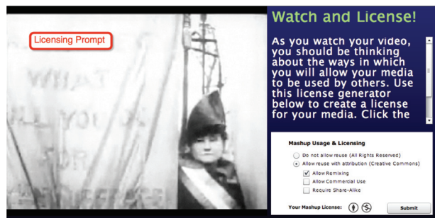
Figure 3 The Mashup game licensing prompt.

Upon completing their creations, students are prompted to choose a license for the finished product to govern how others may use this new creation. Students must choose one of eight licensing tags, ranging from full-restriction copyright to an anonymous dedication to the public domain. In making their licensing choice, students are challenged to consider the financial implications of this decision.