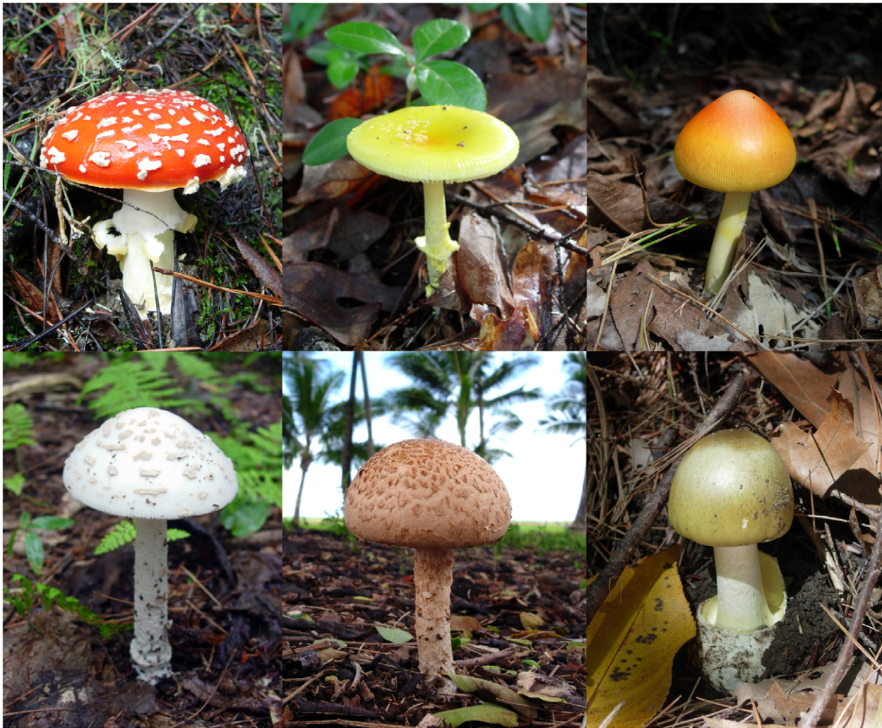
Figure 1. A sampling of the diversity of color and form within the genus Amanita . Clockwise, from top left, Amanita muscaria subsp. flavivolvata , Amanita frostiana , Amanita jacksonii , an undescribed Amanita species, the saprotrophic Amanita manicata , and Amanita phalloides . doi:10.1371/journal.pone.0039597.g001

All EM Amanita species have lost the cbhI-I gene, a CBHI cellobiohydrolase. The loss of CBHI cellobiohydrolases was also observed from the genome sequences of T. melanosporum and L. bicolor [23], [25]. To test whether loss of GH7 cellobiohydrolases is consistent across other EM fungal lineages, we conducted a PCR screen of species in sister EM-SAP clades at two other independent origins of the EM symbiosis: Tricholoma (EM) vs. Clitocybe/Lepista (SAP) and Hebeloma (EM) vs. Galerina/Psilocybe (SAP) [13]. These PCR screens confirmed that CBHI cellobiohydrolases are absent from most EM genomes, but are present in all SAP genomes (Figure S6). Studies that have cloned and sequenced CBHI cellobiohydrolases from fungal communities in a variety of forest ecosystems have not yet matched a CBHI to an EM fungal clade [43], [44], providing additional support for the loss of CBHI cellobiohydrolases as a consistent genomic hallmark of the EM symbiosis.